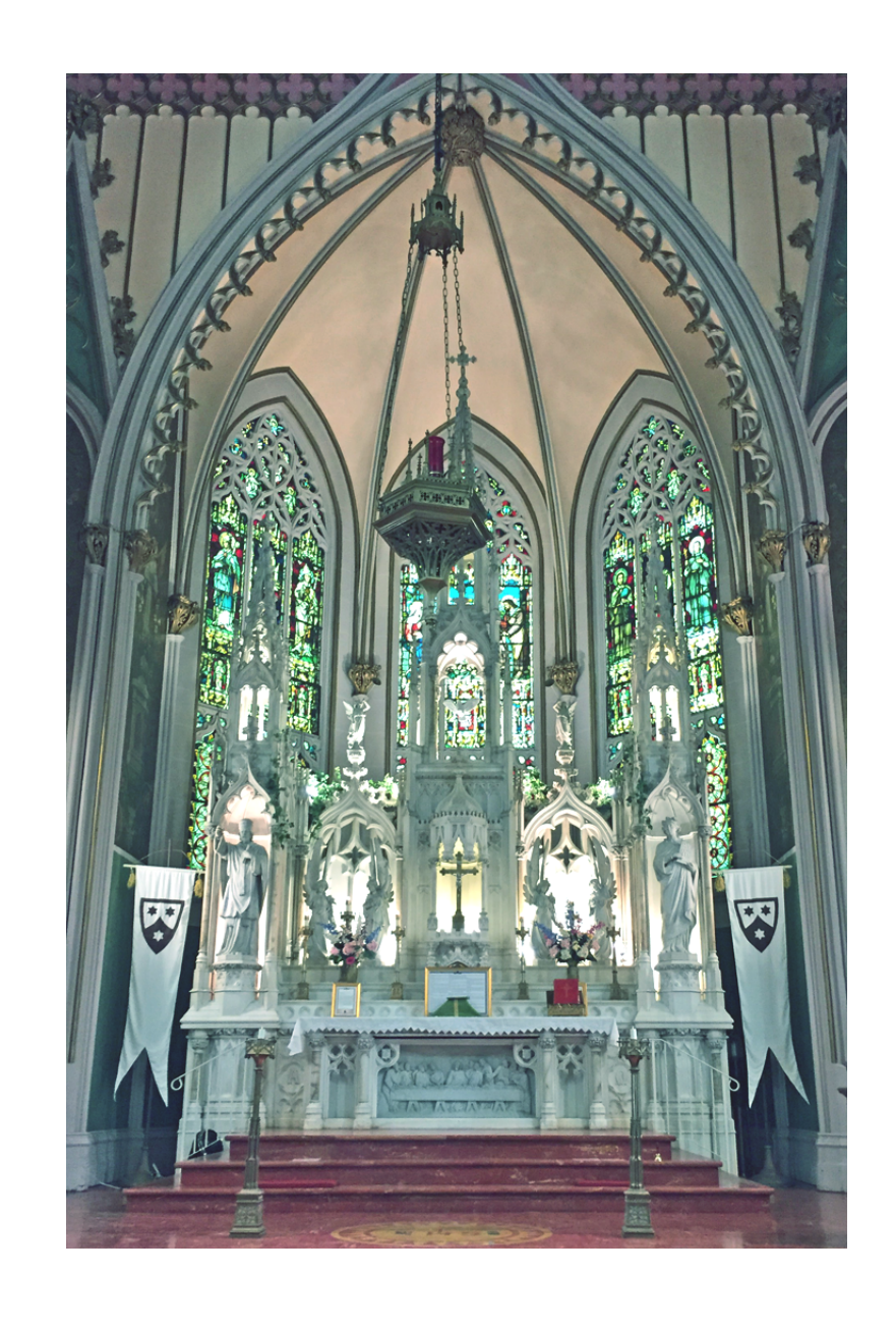
THE CARMELITE MISSAL CHURCH OF ST. JOSEPH TROY, NEW YORK